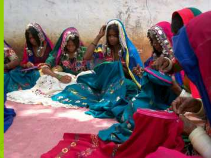
Livelihood Pattern (days) of Lambada Tribals