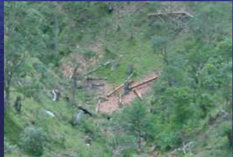
Indiscriminate cutting of trees