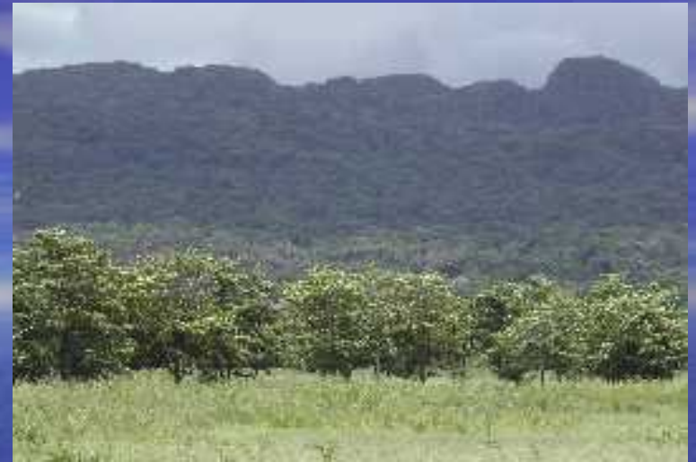
Forest vegetation in the Southeast portion of the country