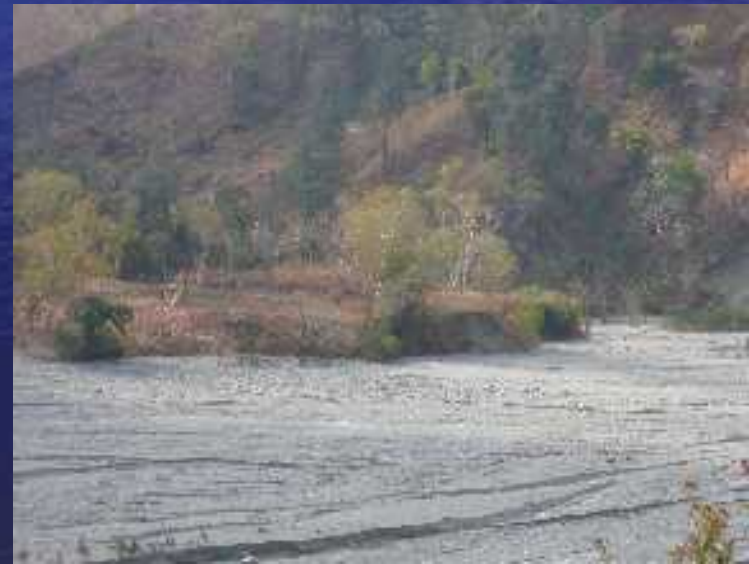
Siltation of river