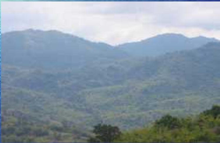
Topography and vegetation in the inner part of the country