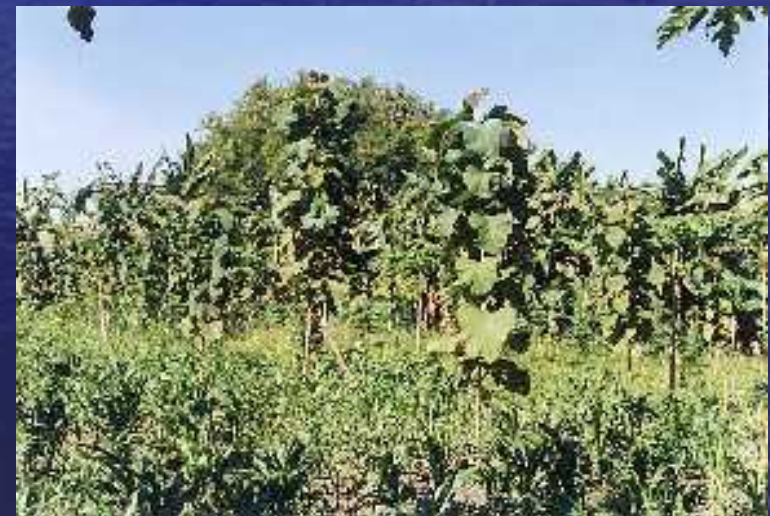
Candlenut and teak planted in individual farm of small group members