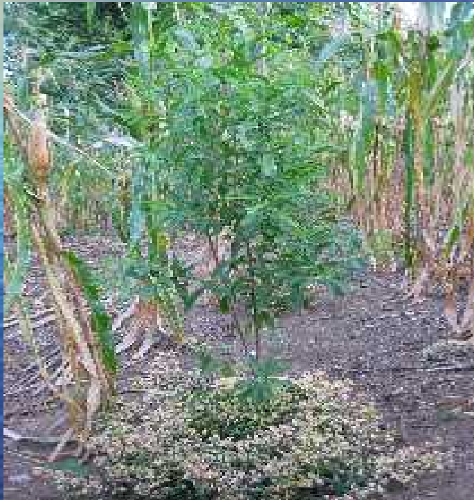
Sandalwood trial planting