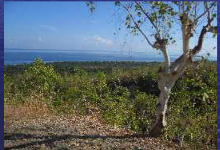
Forest vegetation in the Northwest portion of the country