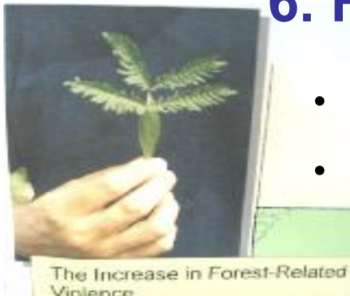
The Increase in Forest-Related Violence