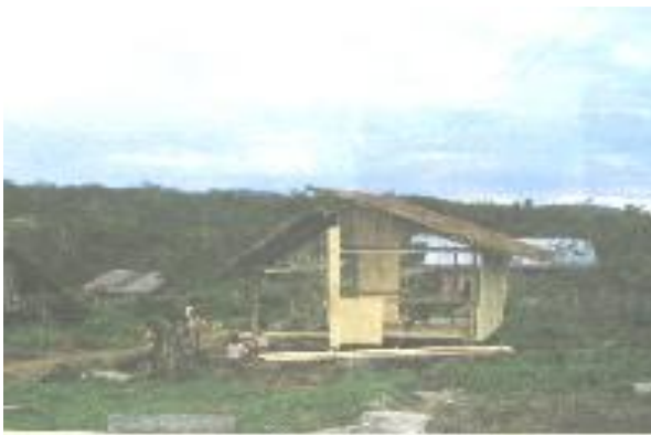
Barangay Site Delineation Barangay Lucas, San Francisco