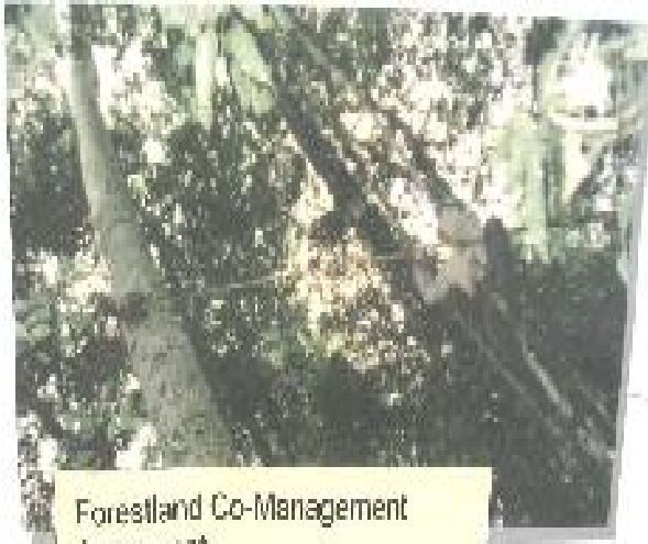
Forestland Co-Management Agreement