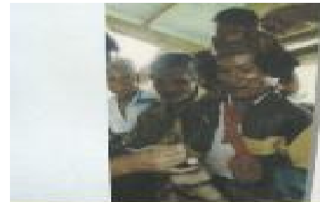
Conflict Management Process in CADC Areas